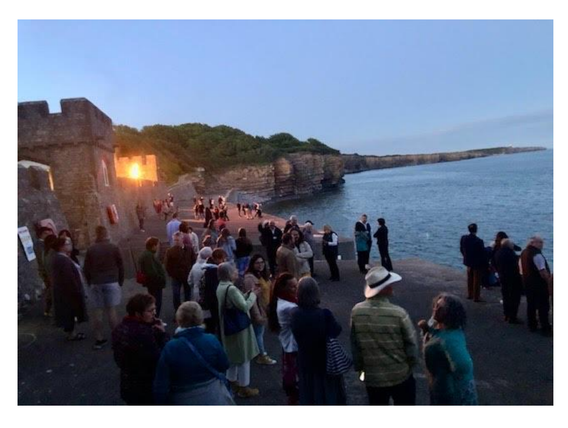
Members of the local community gathered on the beach at Atlantic College to watch the beacon lighting from a different perspective.