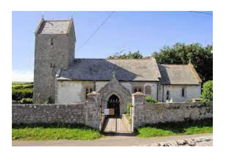
Holy Trinity Church, Marcross.

The Celebrations culminated with a Church Service in Holy Trinity Church on Sunday 5^{\rm th} June.