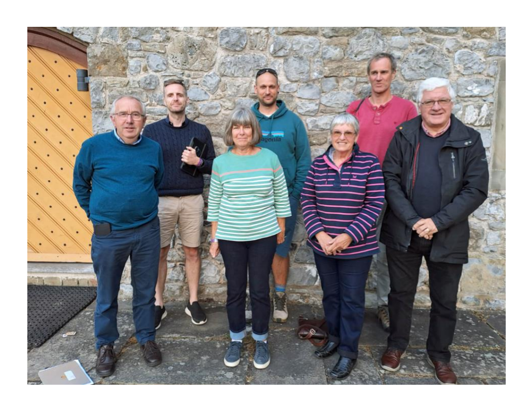
St Donats Community Councillors.