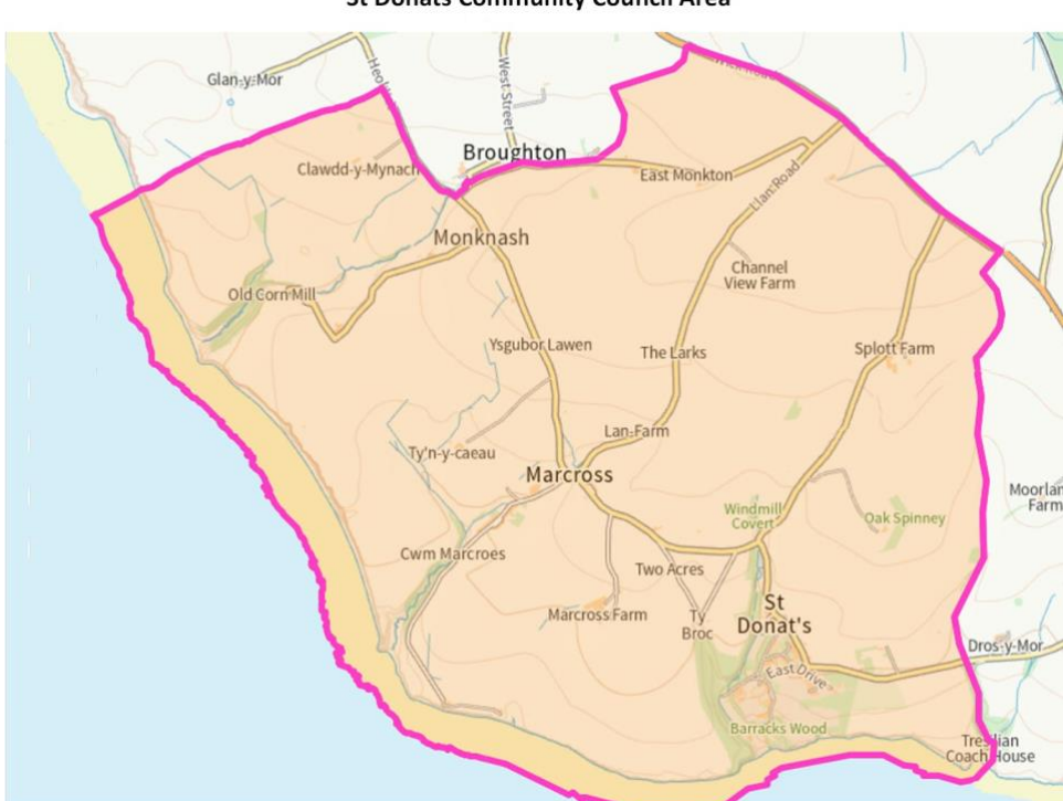
St Donats Community Council Area

St Donats Community Council serves the three villages of St Donats, Marcross and Monknash in the rural Vale of Glamorgan. Community Council information including Minutes, Agendas of Meetings, Community Council's finances and some history of the villages can be found on the Community Council's website at: <a href="https://www.stdonats.cymru">www.stdonats.cymru</a>