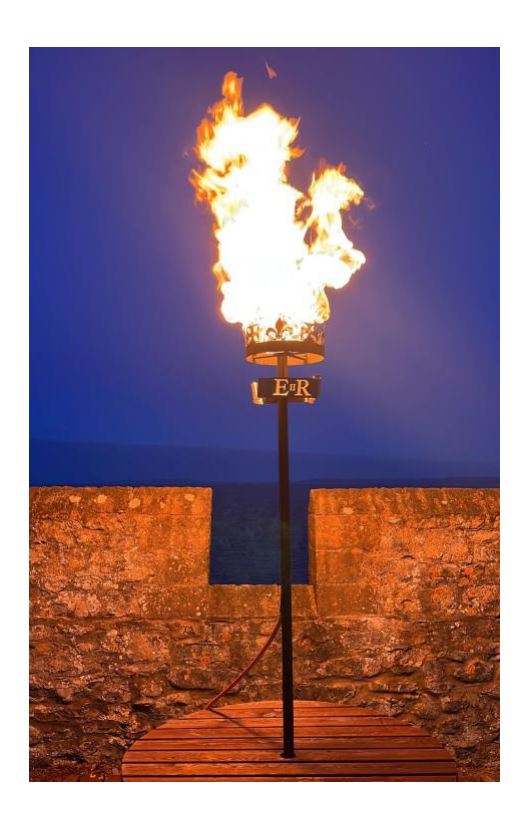
Beacon at St Donats